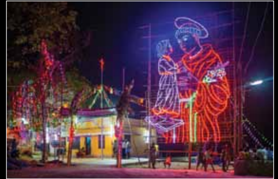
WORKS BY BILLY HICKS